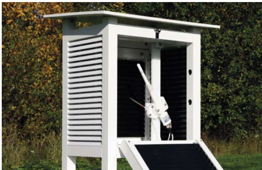
HMP155 with a new, stable HUMICAP®180R sensor and an additional temperature probe.